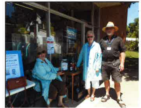
Auxiliary Bottle Drive

In conclusion, we the Auxiliary would like to thank you for your support in all of our endeavours to raise funds and we look forward to meeting our goal once again.