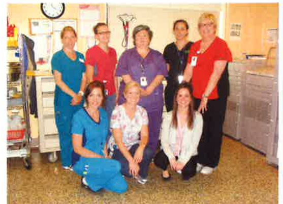
Students & Preceptors from Fleming & Loyalist Colleges and Staff