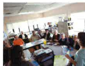
Diabetic Clinic Teaching