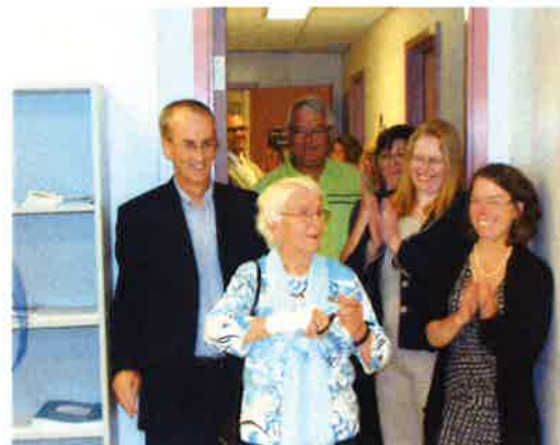
Trent Hills GAIN Open House

We passionately pursue excellence, and create a better experience by putting our best selves forward every day