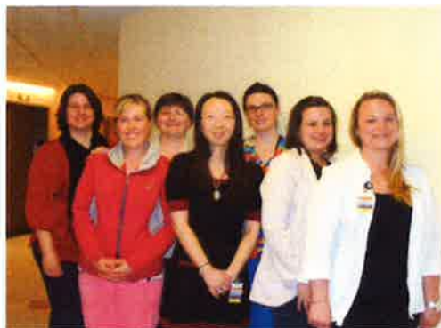
CMH's GAIN Team

CMH Volunteers provide compassionate and appropriate support to patients and their family members while in the Emergency Department waiting health care attention. It's an opportunity to positively impact the patient and visitor experience.