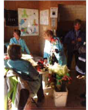
Auxiliary Valentine's Special

The sole purpose of our Auxiliary is to fundraise in order to purchase equipment needed at the hospital. This meets the strategic objective of the hospital to enhance the equipment and to provide a safe environment with quality care for our patients. This year we raised enough money to purchase two electric beds and two pain pumps.