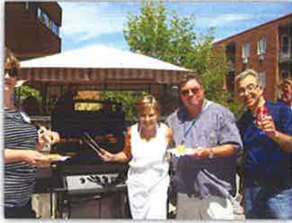
Annual Staff Appreciation BBQ Hosted by the Management Group