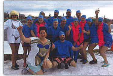
2018 Annual Polar Plunge